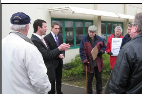
The Ramsey Close Protest