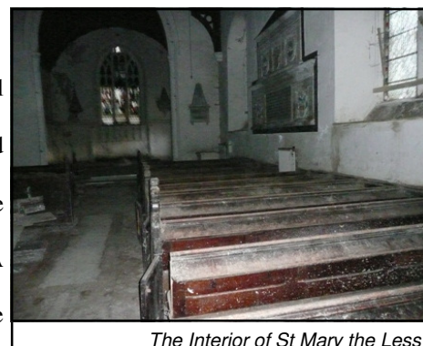
The Interior of St Mary the Less