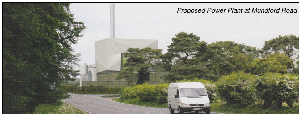
Proposed Power Plant at Mundford Road